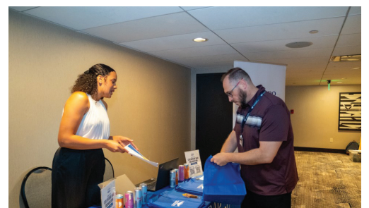
CBF Booth at the CLE institute